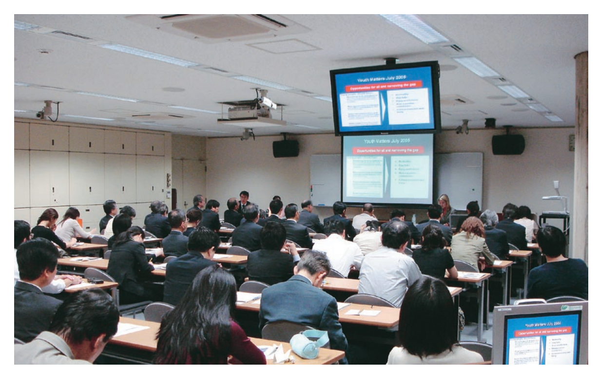
講演会場(国立国会図書館 東京本館 大会議室)