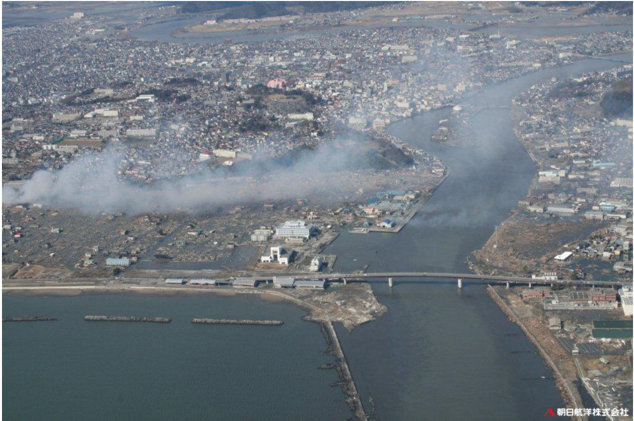
<<Mouth of Kyu-Kitakami River: buildings around the gulf of Ishinomaki suffer direct damage from tsunami which led to a fire.>>

For the whole list of searchable databases including the above, please see http://kn.ndl.go.jp/static/db?language=en .