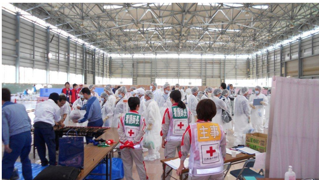
<<Red Cross relief team members helping residents temporarily visiting their homes.>>

Information and data about nuclear power plant accidents have been collected and accumulated to formulate guidelines on Red Cross activities including voluntary work covering prevention, aid and rescue, and recovery and reconstruction, in preparation for a future nuclear accident. The archive includes records of rescue conducted by the Japanese Red Cross Society after the accident at the Fukushima Daiichi Nuclear Power Station, and interviews with doctors and nurses of Fukushima Red Cross Hospital, rescue team members from other prefectures, and staff members of the Japanese Red Cross Society branches. 482 documents, 191 photos, 5 videos and others are available as of February 2014.