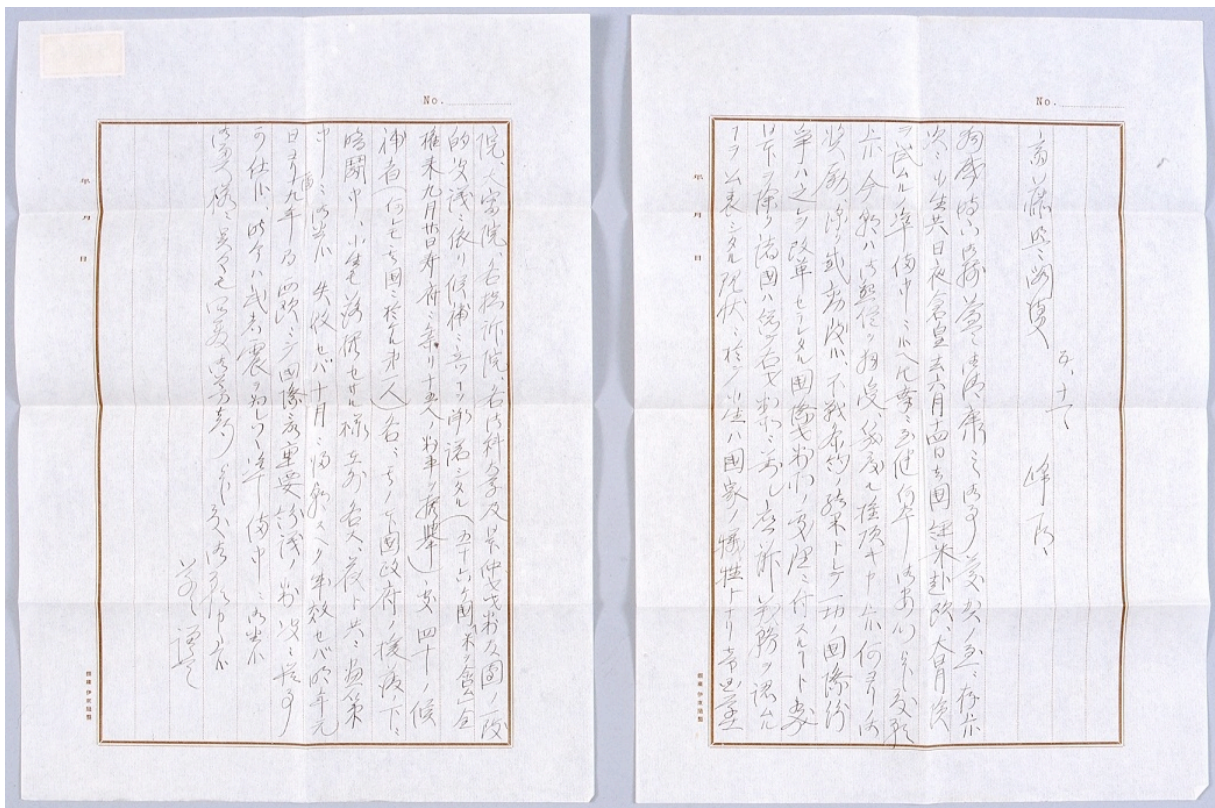
<<Photo 4: SAITO Makoto Papers, Letter #270-3 (held by the Modern Japanese Political History Materials Room, Tokyo Main Library)>>

Responding to Yamakawa's comment "there is no doubt of Japan's win if you run in the election," Adachi harshly wrote on the letter "what a carefree view"; and to "your post will be secured for the future," wrote "that is not necessarily so" (Photo 3). It is obvious that Yamakawa in the letter intended to encourage Adachi. However, having seen diplomatic realism including conflicts of national interests, he might have regarded even the words of encouragement as too optimistic. Adachi wrote in his private letter sent to Makoto SAITO (1858-1936, the 30th Prime Minister) that candidates for judge "are contesting behind the scenes supported by their home governments" (Photo 4).