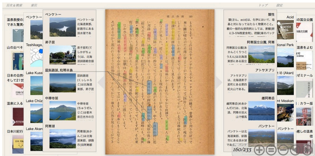
<<Reading support function>>

from the whole texts of the material. You can see the materials' main topics from frequency of keywords in the texts.