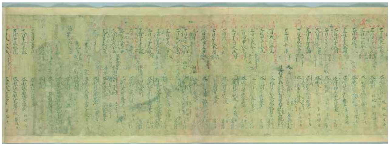
<<The back of the sheet; a calendar of the fourth year of the Kōan period (1281)>>

The copy owned by the NDL is handwritten on the back of a calendar of the period between intercalary July 27 and December 26 of the fourth year of the Kōan period (1281). It includes the two articles " Rotōrei " and " Shosatsurei ," but unfortunately, the introduction of the " Rotōrei " is missing. It is presumed to have been made during the late Kamakura period, not so long after its compilation.