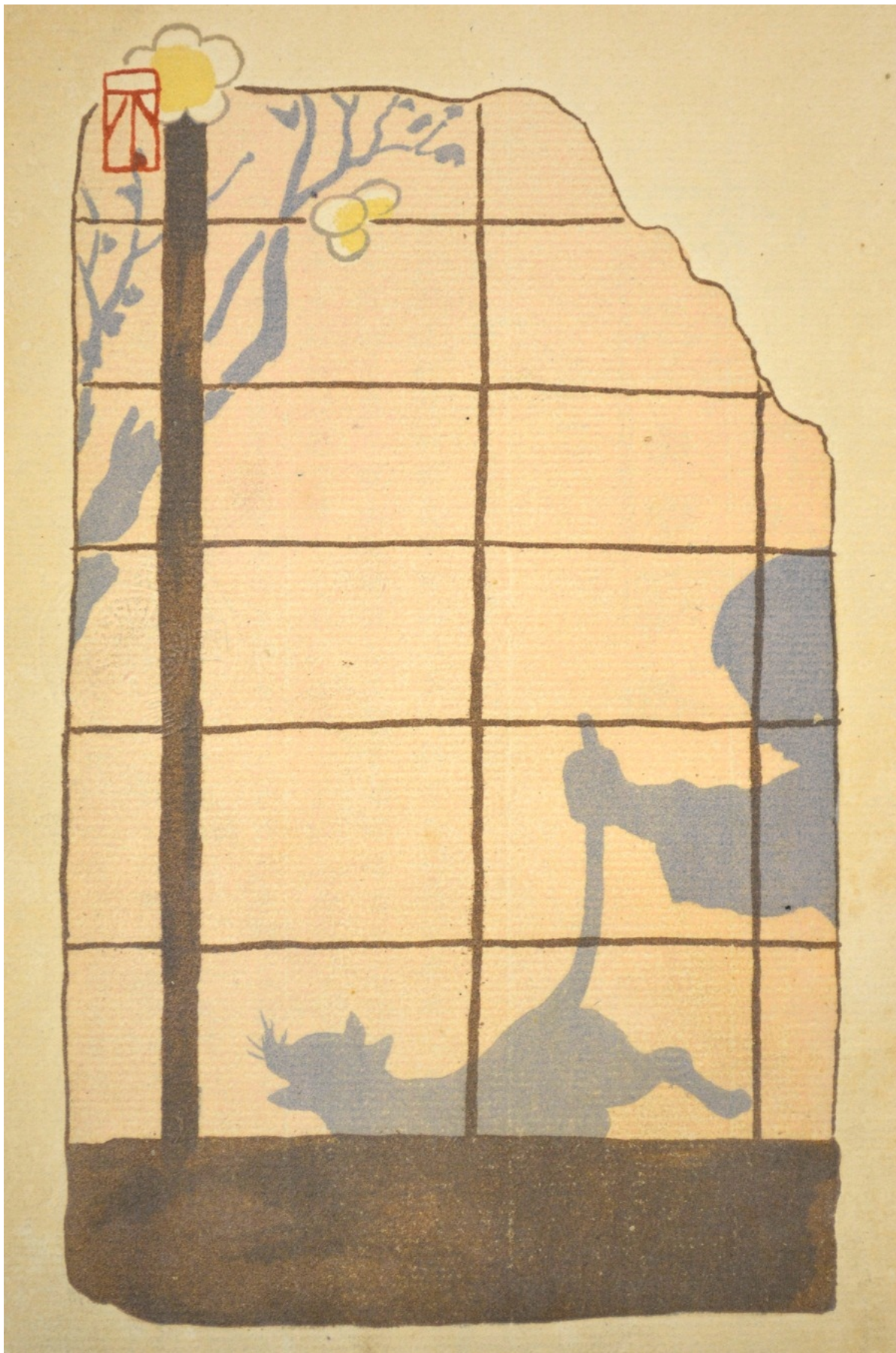
<<An illustration from Wagahai wa neko dearu >>