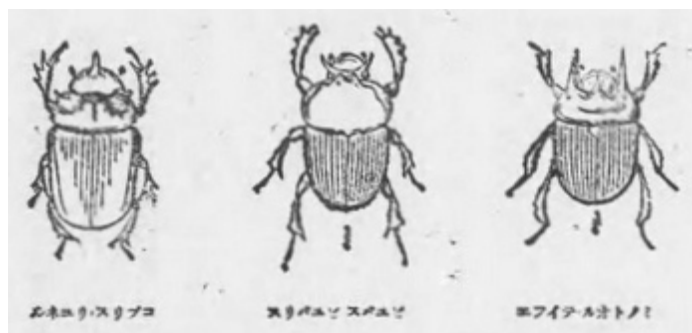
<<Sketches of insects by Fabre>>