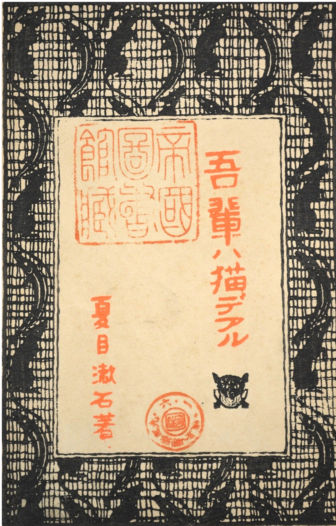
<<Original cover of Soseki's Wagahai wa neko dearu >>

(lit. I Am a Cat) published by Ookura Shoten from 1905 to 1907; NDL Call No. 26-344