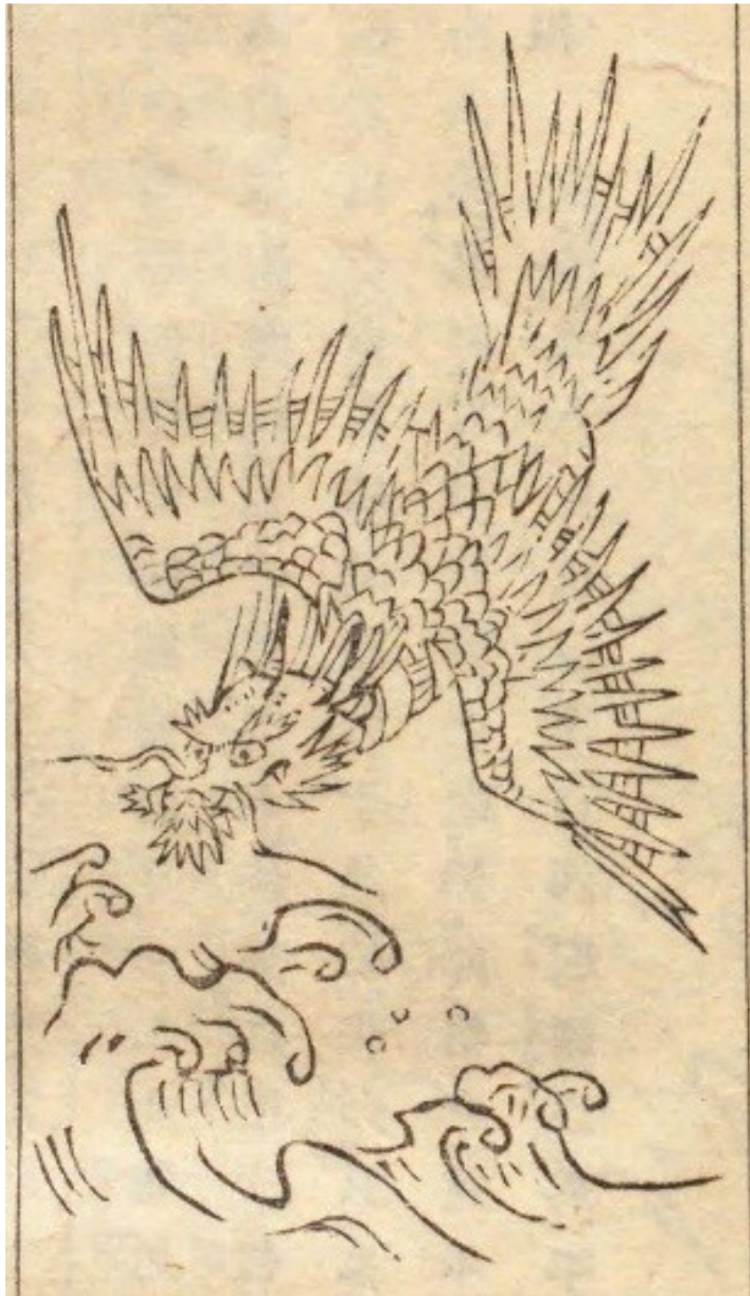
<<Yinglong (Winged dragon)>>

(lit. Illustrated Sino-Japanese Encyclopedia) published by Naito Shooku in 1890 NDL Call No. 031.2-Te194w-n2