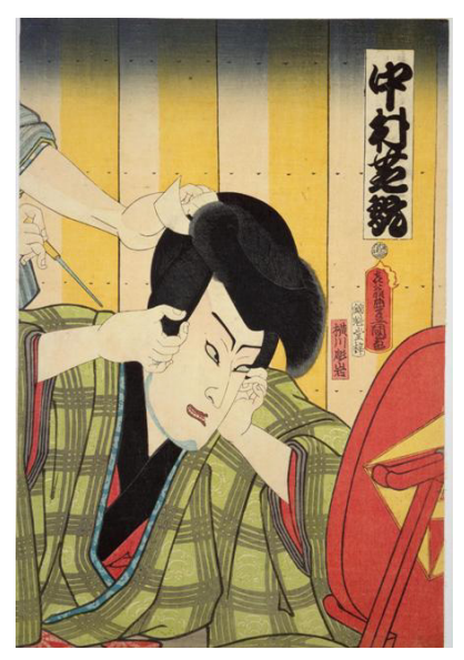
(Photo 2) Portrait of Nakamura Shikan depicted by Toyokuni UTAGAWA Printed in " Toyokuni gajo " published by Kinkaido (錦魁堂) in 1861, NDL call no.: 本別 7-521 Shikan in this portrait is putting on a wig backstage.

At the start stands Tenjiku Tokubei riding on the back of a giant toad with a makimono (hand scroll) opened out. You can see the indications to the target spot (a portrait) according to the pip of a die in the makimono (see photo 3). In the other spots, such as photo 4, are written instructions of where to move the pieces on each spot. When there is no instruction on the spot, players have to wait until their next turn.