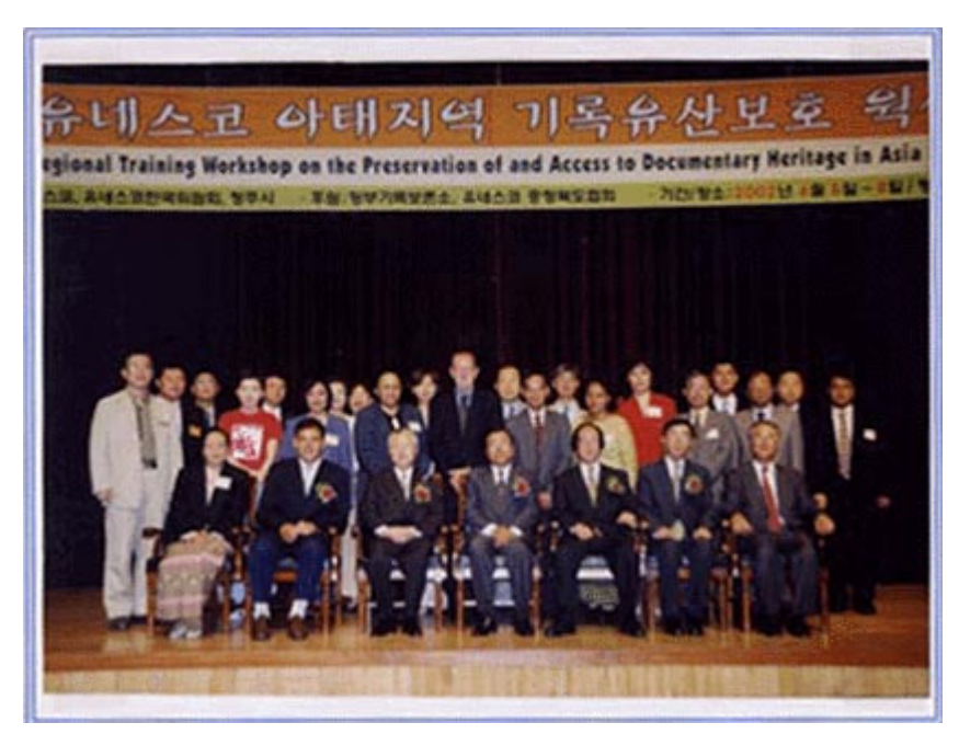
Souvenir picture taken after Opening Ceremony

Library Counselor, Acquisitions Department