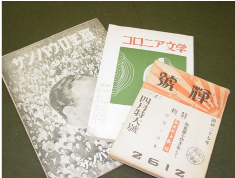
3) Yamamoto collection: Owned by George Yamamoto. About 600 volumes of monographs on Japanese emigrants in Hawaii, in Japanese or English.