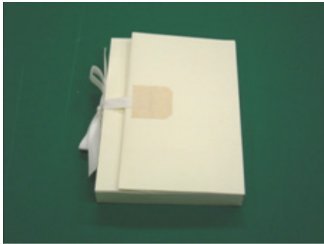
<<Four-flapped folder introduced at workshops>>

A handy, easy-to-make enclosure was introduced at the workshops because protective enclosures can be used to prevent materials which cannot be repaired from further deterioration.