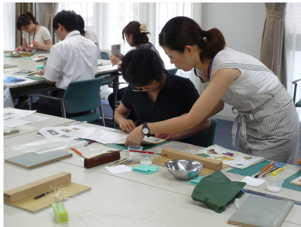
<<Training for the university libraries in the Tohoku region>>

Since July 2011, the NDL conducted training programs for post disaster recovery in Iwate, Miyagi and Fukushima. It was the prefectural libraries which played a major role in putting the programs into practice. All three of the prefectural libraries made library visits in the affected areas many times and saw the local libraries faced with large numbers of damaged books and not knowing what action to take, as most of such libraries have no preservation teams or specialists of their own. The prefectural libraries then consulted with the NDL, which has a department that specializes in preservation, in order to provide training programs to the local libraries. In Miyagi Prefecture, the programs were conducted not only for the public libraries but also for the University libraries in the Tohoku region.