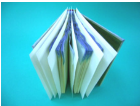
<<Book stood on its end and interleaved>>

The program held at the Iwate Prefectural Library included a workshop on drying wet materials. The simple air-drying method using interleaving paper and fans was introduced. The workshop also covered mold removal. Participants learnt procedures to treat infested materials with disinfectant ethanol and brushes. Dummy books were used for this practice. The health hazards and allergic reactions caused by molds, and the mechanism of mold outbreaks, were mentioned and emphasis was put on the importance of ensuring safety of people and environmental control.