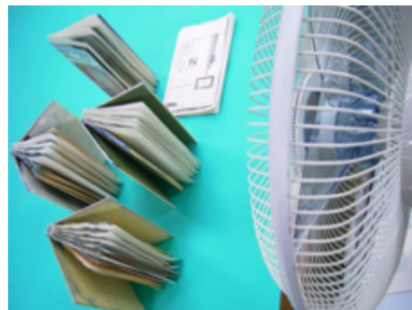
<<Circulate the air with fans>>

(colored water has been used to wet the demonstration book shown above)