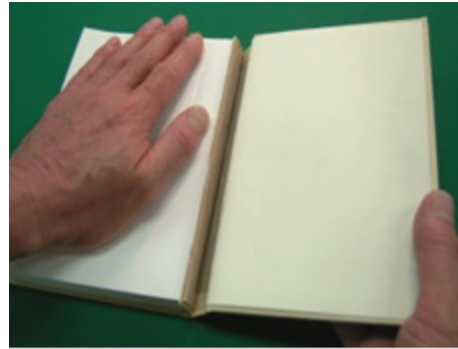
<<The detached cover to be glued on the tube>>