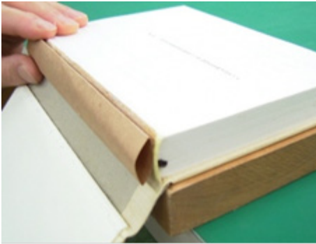
<<The tube glued on the spine>>

Procedures for repairing squashed book corners and split joints were also demonstrated to the participants as possible ways to apply the basic repair techniques they had learnt in the workshops.