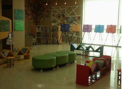
<< Exhibitions at the National Library for Children and Young Adults (left) and the Subong Library in Incheon Metropolitan City (right), Repubic of Korea>>

The ILCL, donee of this treasure of global value, is required to lend it out to domestic libraries and libraries in the Asian and Oceanian regions for exhibitions. From August to October 2013, exhibitions were held in the Republic of Korea, at the National Library for Children and Young Adults and the Subong Library in Incheon Metropolitan City.