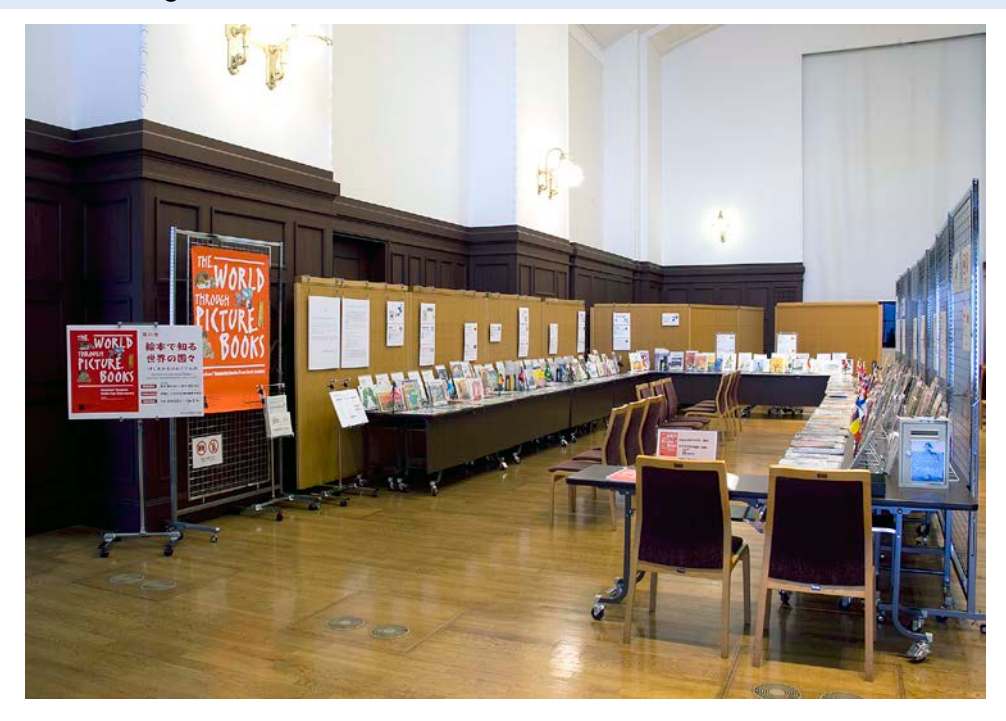
<<Full view of the exhibition in the Hall of the International Library of Children's Literature>>

The International Library of Children's Literature (ILCL), National Diet Library, has been holding various exhibitions on children's books since its opening in 2000. The exhibition titled "World Through Picture Books - Librarians' favourite books from their country" held from May 9 to June 9, 2013, was rather small but a special one for its background. About 260 picture books from 33 countries and regions on exhibit were available for free browsing and on site reading, displayed country by country along with the national flags, small panels presenting each country with a map, and greetings in the national language.