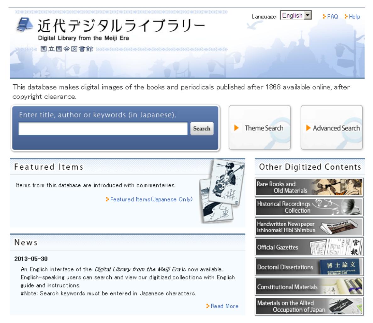
Top page of the "Digital Library from the Meiji Era" >>

However, not all had been smooth sailing; the digitization had to proceed on a meager budget which only allowed an annual increase of the digitized contents provided to the public of only by some ten thousand. The ratio of digitized contents to all the books held by the NDL reached only 2% by 2008 (around 150,000 items as of the end of FY2008).