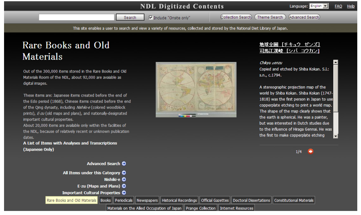
<< Display example of the NDL digitized contents >>

There were also discussions as how to make the most of NDL's digitized contents which consumed enormous amounts of the national budget. In June 2012, the Copyright Act was amended to enable transmitting digital images of out-of-print items to public and university libraries in Japan. By this transmission, users can access and copy them in a public or university library close to their residence. Aiming for its launch in January 2014, the NDL is presently working hard on preparations such as detailing the procedures to accept a claim to exclude a still-in-print publication from the transmitted contents as well as developing the system for transmission.