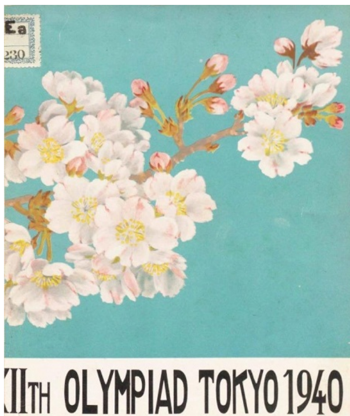
<<XIIth Olympiad Tokyo 1940: olympic preparations for the celebration of the XIIth Olympiad Tokyo 1940, Tokyo: The Organizing Committee of the XIIth Olympiad Tokyo 1940, 1938, [NDL Call No.: Ea-230] *Available in the NDL Digital Collections >>

In the beginning of 1938, the sluggish preparations and deteriorating international situation cast a shadow step by step, and voices against hosting the Tokyo Olympics were heard within a year after the joyous decision at the IOC Session in Berlin. The Second Sino-Japanese War broke out in 1937 and led to supply shortages in Japan, and goods were brought under official control. Following the National Mobilization Law, a regulation for controlling the iron and steel distribution was promulgated in April 1938, which created difficulty in building a new stadium. In addition to those problems, continued demand for cancellation from home and abroad made it inevitable that Tokyo gave up hosting the Olympics. The cancellation was finally decided by the Cabinet on July 15, 1938.