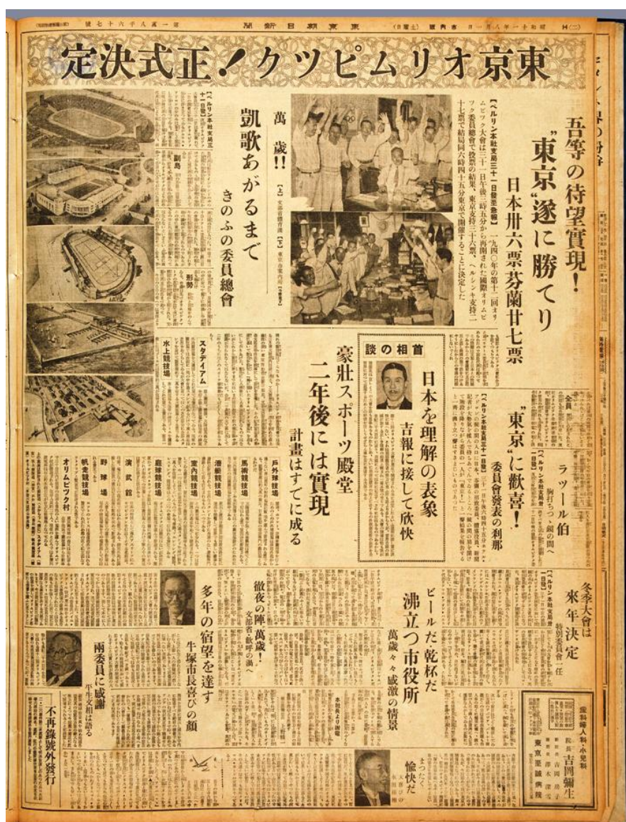
<<"Tokyo Orinpikku! Seishiki kettei (lit. Tokyo Olympics! Officially decided)" Asahi Shimbun (Tokyo) 1936.8.1, morning edition, page 2, [NDL Call No.: Z81-1]>>

The efforts of IOC members, Tokyo City and the national government had raised the possibility of success, and thus Tokyo was elected as the host city at the IOC Session in Berlin on July 31, 1936. The newspaper article below was carried in the morning edition of August 1, the day following the decision on the host city. At the beginning, it is reported that Tokyo won the victory over Helsinki by 36 votes to 27.