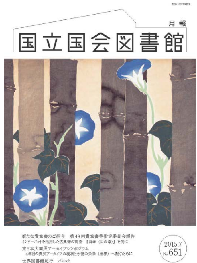
Image 11: Morning glory (cover of National Diet Library Monthly Bulletin , 651, July 2015; the original is in Momoyogusa , vol.1 Available in the NDL Digital Collections )