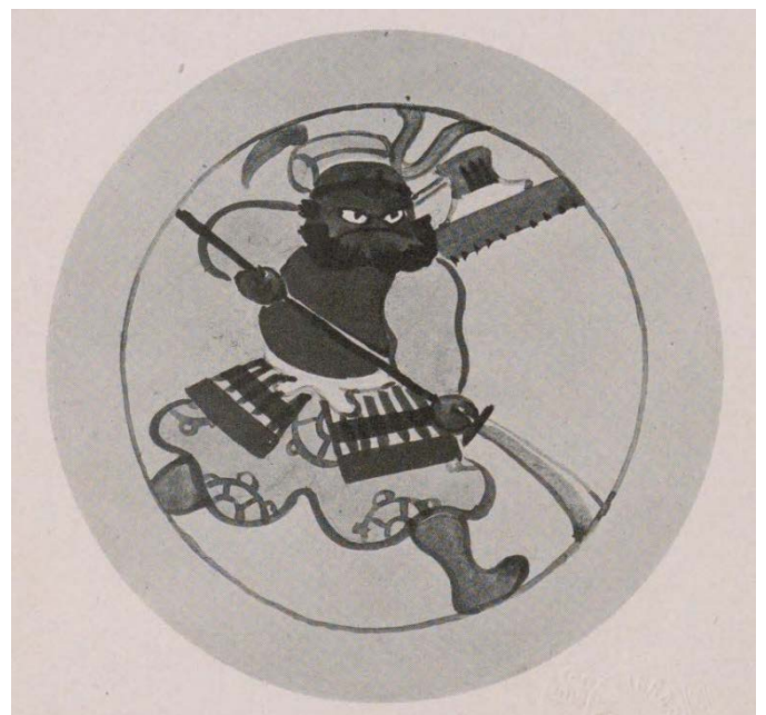
Image 9: Asai's handcraft design shows the influence of Rimpa school (Ishii Hakutei (ed.) Asai Chu gashu oyobi hyoden , Unsodo, 1929 [NDL Call No. 553-116]) Available in the NDL Digital Collections

Asai Chu (1856-1907) and Kamisaka Sekka (1866-1942) are two artists who were typical of those influenced by the Rimpa school but through the importation of Art Nouveau to Japan. Asai was a prominent painter who helped introduce European painting techniques during the Meiji period. In addition to producing European-style paintings, he also created numerous handcraft designs. His handcraft designs show the influence of Rimpa school in their motifs and rounded patterns.