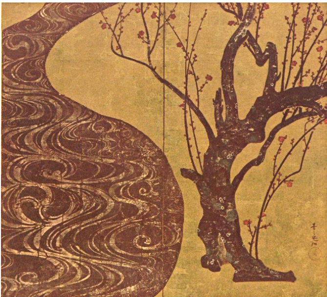
Image 1: Red apricot tree on the right-side screen of the national treasure Kohaku Baizu Byobu ; (Kanai Shiun (ed.), Geijutsu Shiryo , 1, vol.11, Unsodo, 1941 [NDL Call No. K231-35] Available in the NDL Digital Collections )

This exhibition is intended to present some of books that were indispensable to the transmission and development of the Rimpa school, and to provide some unique insights that only a librarian would have into this subject matter by introducing selected items from the exhibition.