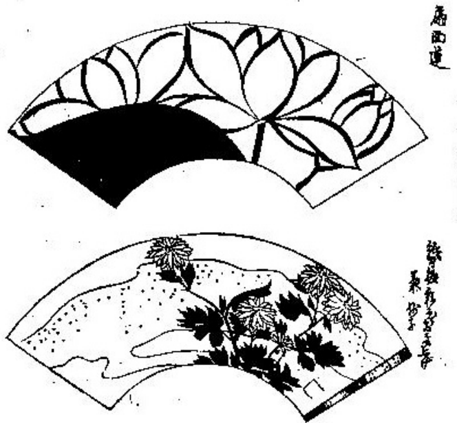
Images 5 (top) and 6 (bottom) show fan designs from Korin Hyakuzu : a lotus design and a chrysanthemum design, respectively. Korin gained acclaim in Europe while Japonism was in vogue, and artists there took ideas from his fan designs. (Ogata Korin (paint), Sakai Hoitsu (ed.) Korin Hyakuzu , first part, Hakubunkan, 1894 [NDL Call No. 特 67-186]) Available in the NDL Digital Collections

Although Japan had closed itself off to most of the rest of the world during the late Edo period, it did maintain a trade relationship with the Netherlands, although direct contact was limited to the small, artificial island of Dejima in Nagasaki (related digital exhibition: Japanese-Netherlands Exchange in the Edo Period ). Thus, the Netherlands played a major role as a window to Japanese culture from overseas. Philipp Franz Balthasar von Siebold (1796-1866), a doctor dispatched to Japan by the Netherlands to conduct scientific research in Japan, brought back from Japan a collection of materials, including multiple volumes of Korin Hyakuzu , part of which is still held by the Museum Volkenkunde (Netherlands) and Bibliothèque nationale de France.