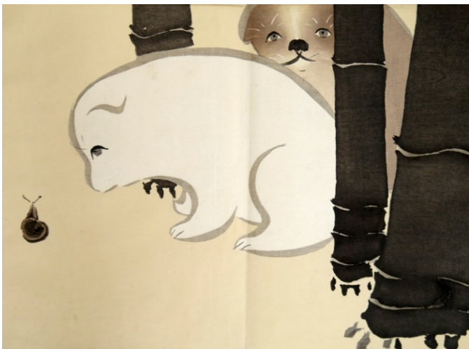
Image 10: Puppy ( Momoyogusa , vol.2 Available in the NDL Digital Collections )

In contrast, Kamisaka, who is considered the founder of the modern Rimpa school, absorbed the Rimpa school as an example of traditional Japanese art but maintained a negative view on Art Nouveau. As a handicraft designer, he displayed great skill in decorative design of products for everyday use, including kimonos, pottery, and lacquerware. Kamisaka was also known as a pioneer in modern woodblock prints, and the design album, entitled Momoyogusa (A World of Things, three volumes, Yamada Unsodo, 1909-1910, [NDL Call No. 406-32]), is considered the culmination of his design work. This work contains Kamisaka's characteristic woodblock print design, featuring sophisticated composition, exaggeration, and a wide variety of subject matter, including animals, plants, and scenes from daily life.