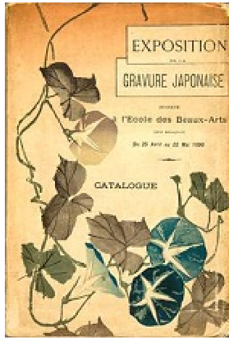
Image 8: Catalog of the exhibition "Exposition de la gravure japonaise (Exposition on Japanese Woodcuts)" planned by Samuel Bing (real name: Siegfried Bing), central figure in the development of Art Nouveau (From catalog of the exhibition " Japan and the West—Intersection of Images " held at the NDL in 2012)

Japanese fine art spread to Europe through a variety of international expositions held in Vienna and Paris during the latter half of the 19th century, and Japonism was soon a popular trend. Composition using patterns of plants and the use of patterns using natural forms had a tremendous impact on Europeans and were soon evident in the works of Impressionists. The decorative nature of works from the Rimpa school can be seen in the developments in European art that led to the emergence of the new form of design that became Art Nouveau.