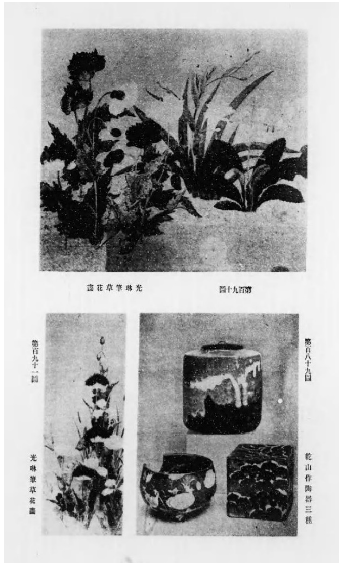
Image 7: Photos on a page about the Rimpa school and Kano school: a painting by Korin and pottery by Kenzan (Ernest Francisco Fenollosa et al. Toa bijutsushi ko , second part, Fenollosa Shi Kinenkai, 1921 [NDL Call No. 509-1] Available in the NDL Digital Collections ; the original title is Epochs of Chinese and Japanese art: an outline history of East Asiatic design [NDL Call No. K141-A16])

part of Fenollosa's collections, which include Matsushima-zu Byobu (Waves at Matsushima), a folding screen by Korin that is worthy of the national treasure designation.