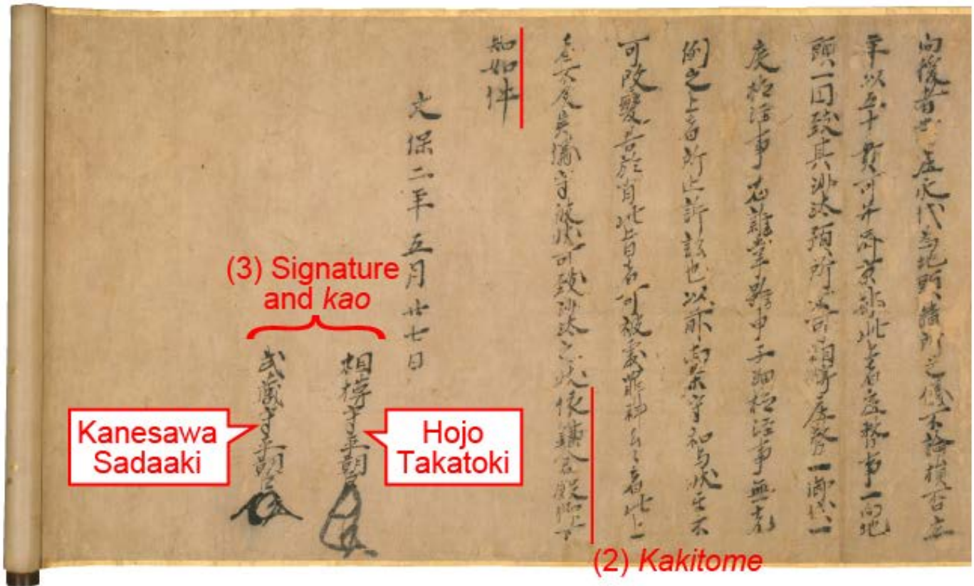
An enlargement of the latter part of the document

this document delivers a judgment. In medieval Japan, such judgments were called saikyo , and this type of document is also called a kantosaikyojo . In this article, we will describe the format and style of the document without reference to the judgment itself, which is complicated and difficult to understand. The format, which is called gechijo , was commonly used by the Kamakura Shogunate and reflects its political structure.