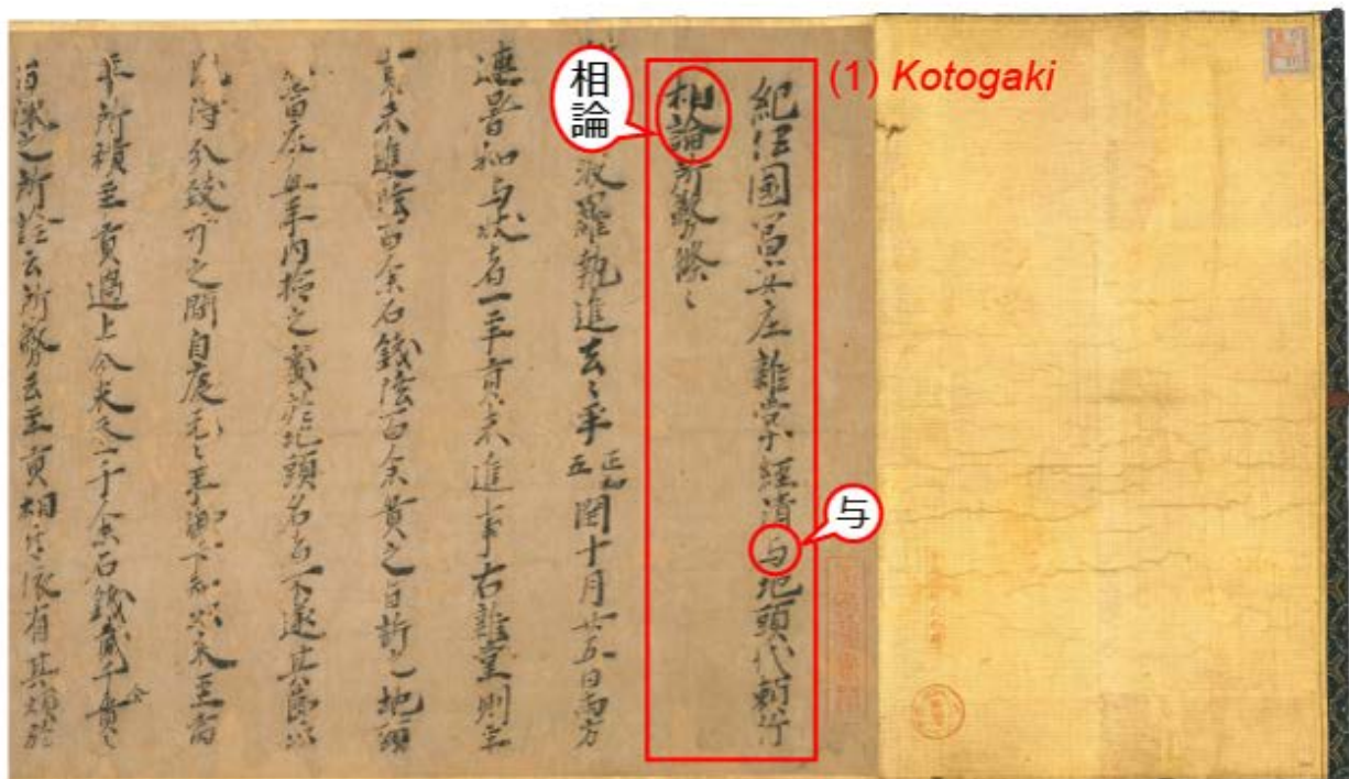
An enlargement of the beginning part of the document

known as a kantogechijo , and the word kanto here refers to the Kamakura Shogunate.