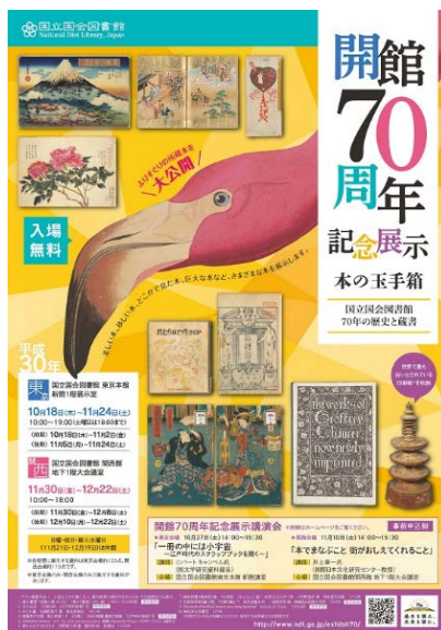
The leaflet of the exhibition

This means that the NDL has collected 10 million books in the 70 years from its opening. In other words, the NDL collected ten times more books than were collected in the previous 70 years.