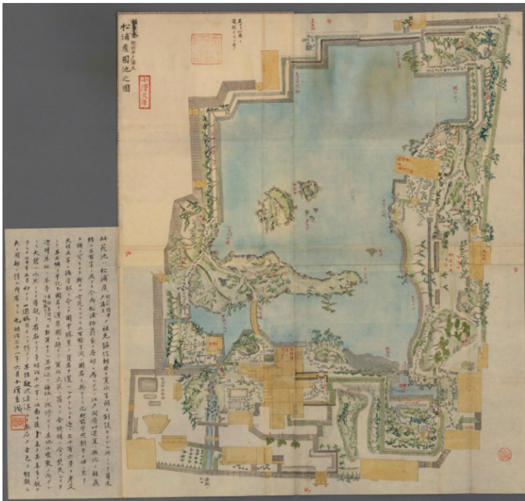
Matsuurako enchi no zu (Landscape of the Matsuura Residence), 1 sheet, 75 cm × 81 cm. NDL Call No. 亥-170. Available on the NDL Digital Collections .

This map is of a site in Asakusabashi where the Matsuura family—daimyo of the Hirado Domain in present-day Kumamoto Prefecture—resided. The garden was designed and landscaped by Kobori Enshu, who was a notable artist as well as a master of the tea ceremony. A note attached to the map describes how it was named Horai en in 1834 by a Kokugaku scholar, Tachibana Moribe, who focused on Japanese philology and philosophy.