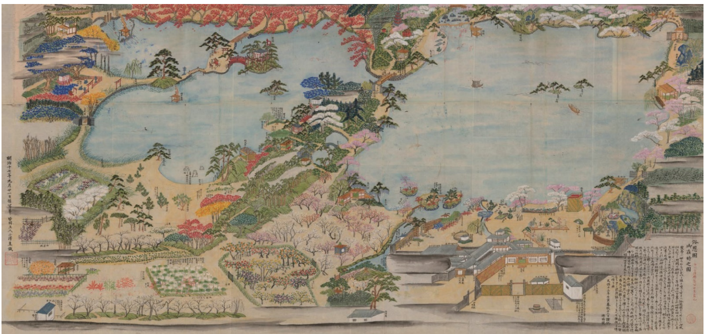
Edo yokuon en zenzu (Landscape of Yokuon en Garden) copied in 1884 by Ozawa Kei. 1 sheet, 80 cm × 160 cm. NDL Call No. 亥-20. Available in the NDL Digital Collections .