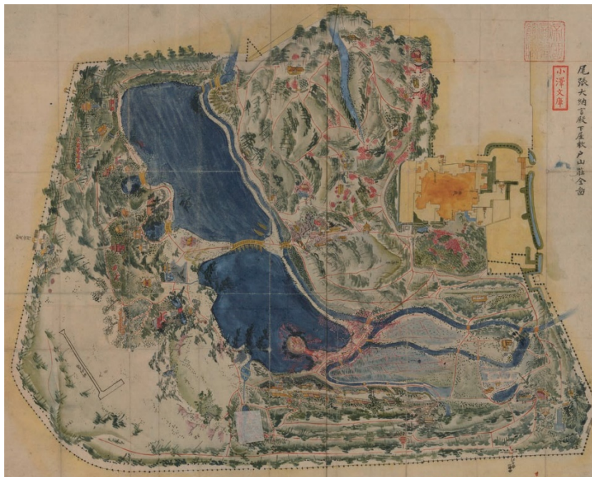
Owari dainagondono shimoyashiki toyamaso zenzu (Map of the Toyamaso Garden attached to a residence belonging to the Owari-Tokugawa family) 1 sheet, 62 cm × 72 cm. NDL Call No.: 亥-88. Available in the NDL Digital Collections

At the bottom left of the house is an artificial hill that was called Gyokukenpo. Constructed to a height of 15 meters using soil from the excavation of artificial pond, it still exists today in Toyama Park but is now called Hakoneyama.