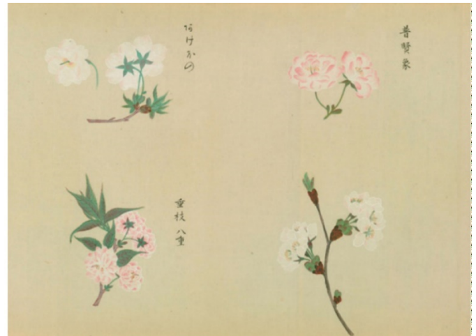
Yokuon shunju ryoen okafu edited by Matsudaira Sadanobu copied in 1884 by Kano Ryoshin. One roll, 27 cm. NDL Call No. へ二-21. Available in the NDL Digital Collections .

end of the Edo period, the garden had become dilapidated. Its ruins became the site of a Navy facility and eventually the Tsukiji Fish Market.