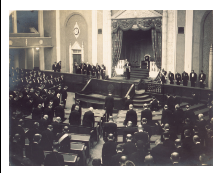
Image 2: Photo of the third provisional building of the Imperial Diet

Some of the most striking photograph albums in the collection are those taken in the aftermath of the Great Kanto Earthquake, which occurred on September 1, 1923. For those of us who experienced the <u>Great East Japan Earthquake</u> in 2011, especially, these photographs vividly depict as if it were yesterday a disaster that occurred 92 years ago. Portable folding cameras, called "clap cameras," had just appeared on the market, and many of the photos taken of the devastation caused by the 7.9-magnitude earthquake were taken with these devices. Kanto Daishinsai shashincho (lit. photograph album of the Great Kanto Earthquake) (Images 3 and 4, NDL Call No. YKA11-