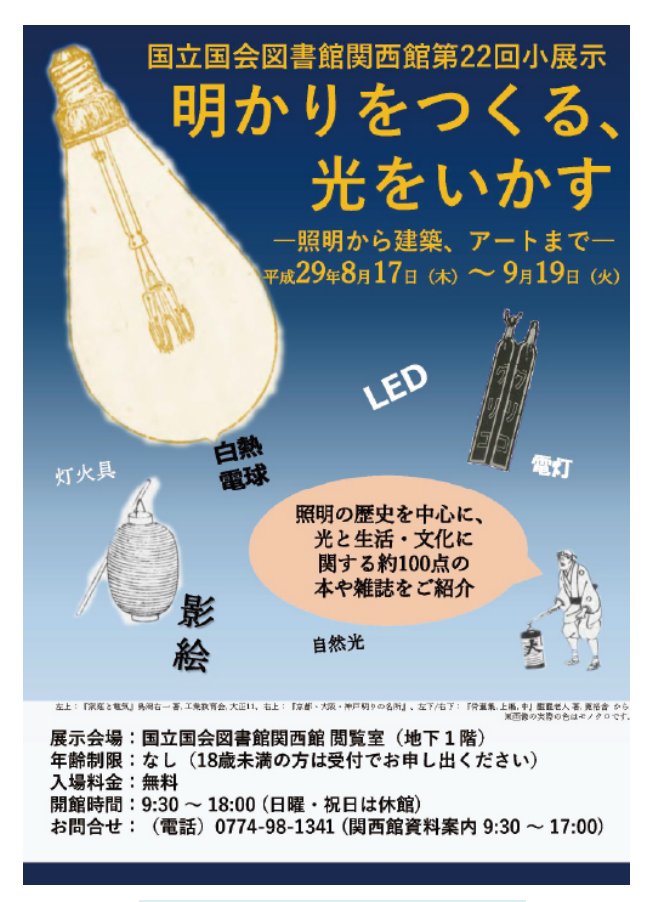
Poster of the small exhibition

A small exhibition in the Kansai-kan, entitled "Making and utilizing light-from illumination to architecture and art," was held from August 17 to September 19, 2017. It featured approximately 100 different books and magazines related to light, lifestyle, and culture, focusing our attention on the history of illumination. In this article, we will introduce part of the exhibited content.