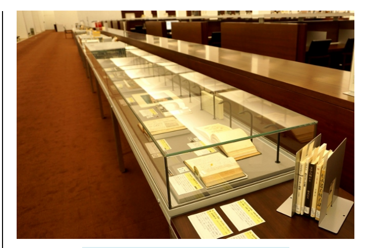
Displays of the exhibition

From traditional forms of lighting, such as torches, candles, and kerosene lamps, to modern ones, including incandescent lamps, fluorescent lamps, and light emitting diodes (LED), this exhibition told the story of how the development of lighting technology has brought comfort and convenience to our lives. It also showed how illumination has had a great influence on our culture and our values. In fact, illumination has of late become a popular feature of many buildings and streetscapes in places throughout Japan.