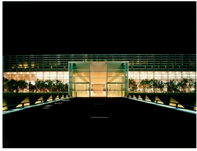
Night view of the Kansai-kan