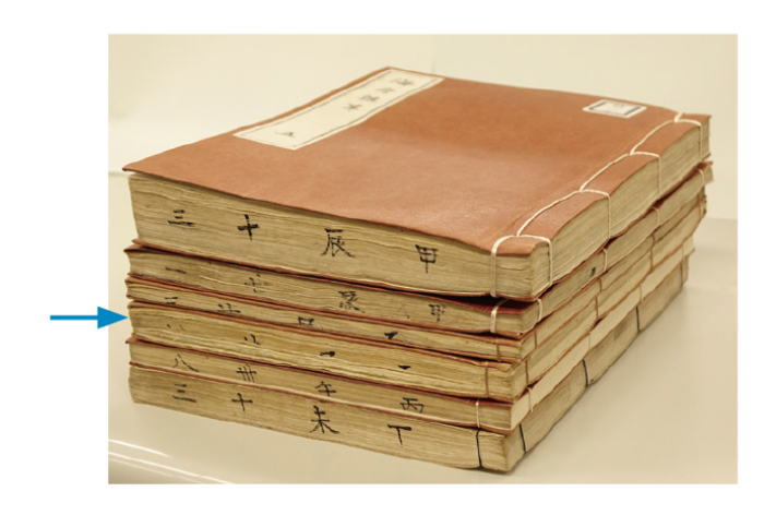
The book edge of Seisai zakki . Some of them are cut off, since they were partly bound.

Incidentally, Seisai also incorporated other authors' works into his reference books. For example, the manuscript of Sekii dosei by HONDA Toshiaki (1743 - 1820), a prominent statesman known as the author of works such as Keisei hisaku and for promoting mercantilist policies, is included in the fifth volume of Seisai zakki , created in 1843. While it might seem strange to modern readers to find Seisai's work incorporated into Kaishu's reference materials, these and other valuable documents have come to light today thanks to this unconventional approach to collecting and preserving documents.