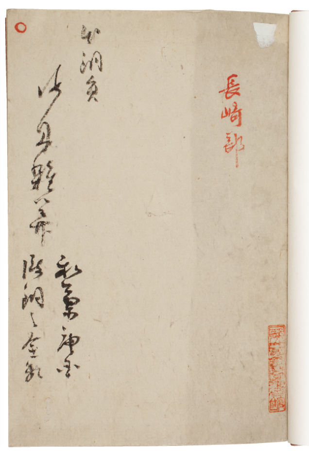
Kaishu zassan 5; NDL Call No. 勝海舟関係文書 16-5 (Katsu Kaishu documents 16-5);

Left: internal text; Right: original cover<sup>1</sup>