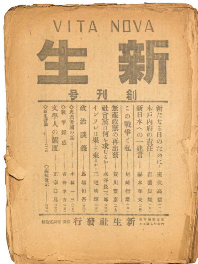
<<Shinsei / Vita nova. No.1, November 1945, Shinseisha NDL Call No. Z051.3-Si16 / VG1-470>>

Shinsei is a general interest magazine first issued on October 18, by Aoyama Toranosuke, a lover of literature and new-comer to the publishing business from Okayama Prefecture. The first issue of 360,000 copies sold out on the first day, within an hour of being put on display in bookstores. The stories describe the social conditions at a time when people were starved for reading material. The first issue includes pieces by writers such as Murobuse Koshin (1892-1970, critic and columnist), Ozaki Yukio (1858-1954, Member of the House of Representatives, Education Minister, Law Minister, and Mayor of Tokyo), Kagawa Toyohiko (1888-1960, clergyman and social activist), Kobayashi Ichizo (1873-1957, founder of Hankyu railway company, Minister of Commerce and Industry, and president of the Toho Films), and Masamune Hakucho (1879-1962, critic and novelist).