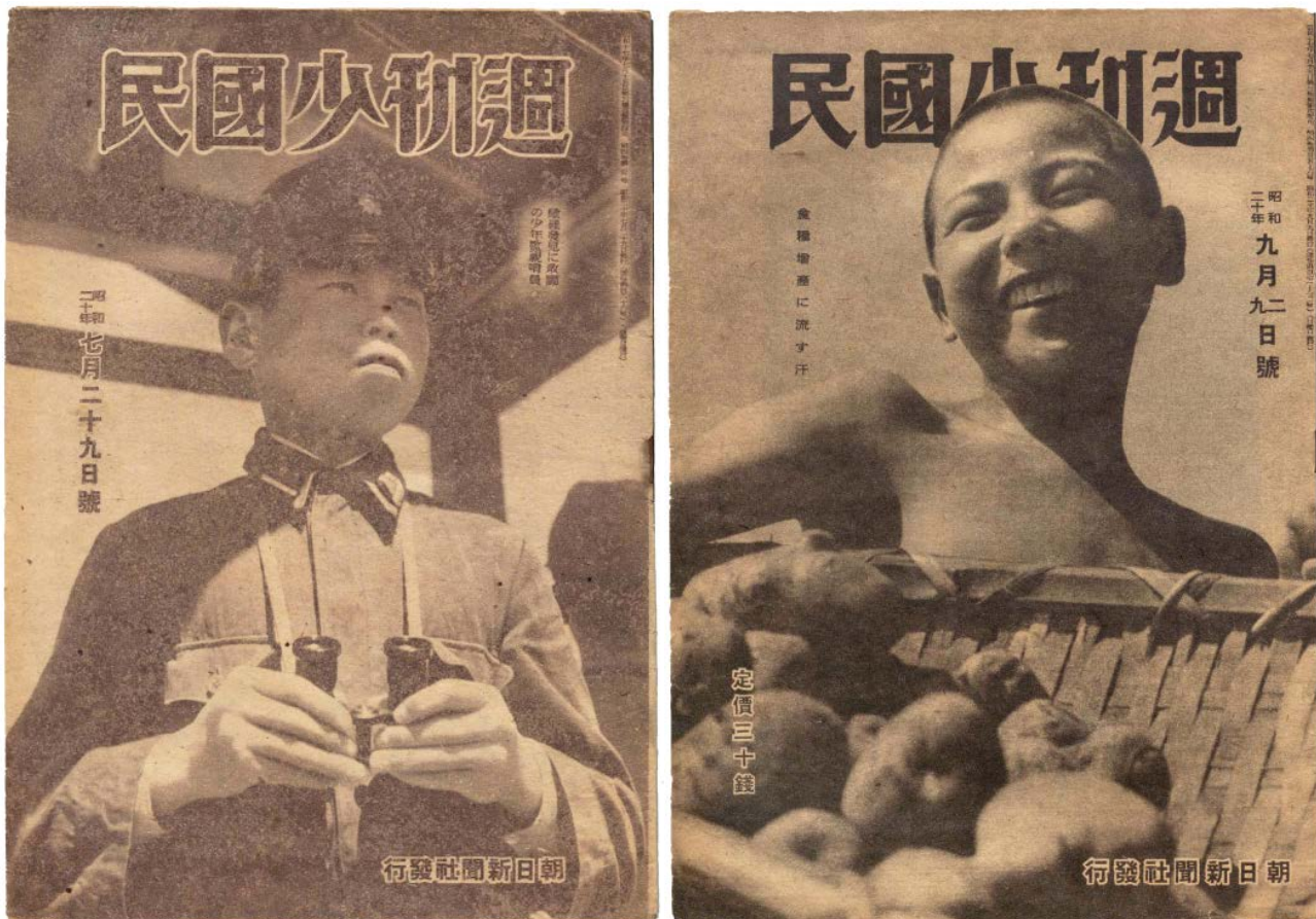
<< Shukan shokokumin . Asahi Shimbun, NDL Call No. Z32-188 (left) vol.4 no.30 (serial no.166), July 29, 1945

(right) vol.4 no.35/36 (serial no.171/172), September 2/9, 1945