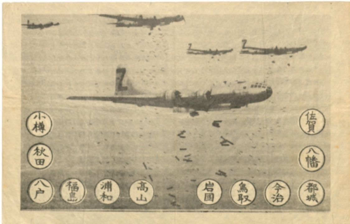
<<Handbills scattered by the U.S. Army Air Forces, July and August 1945 >>