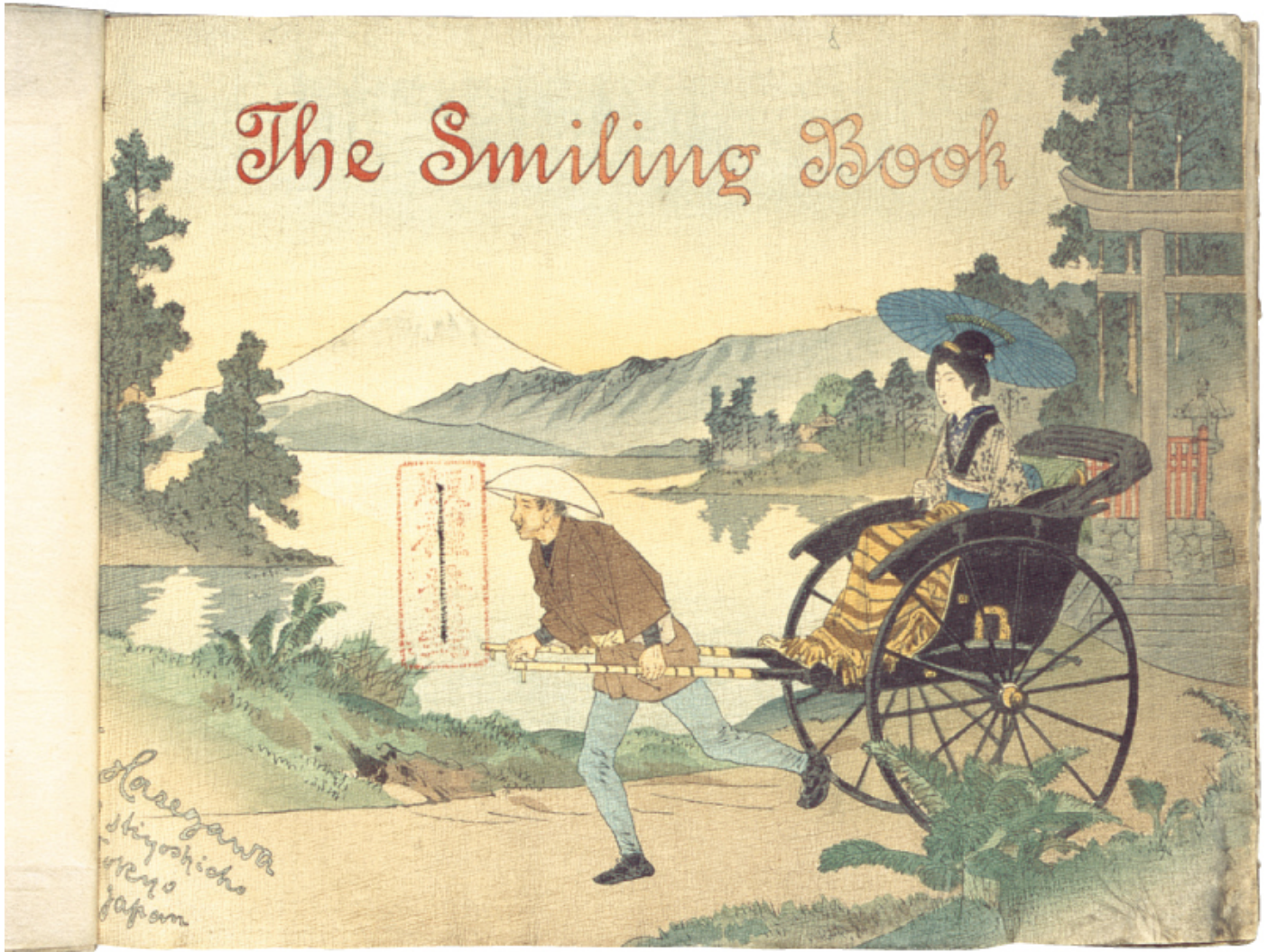
The smiling book.

This article is based on the article in Japanese in NDL Monthly Bulletin No. 659 (March 2016) .