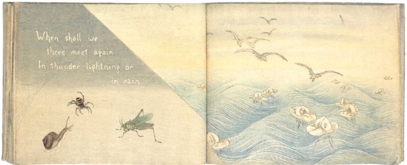
Pages 23-24 of The Smiling Book

the three witches: "When shall we three meet again" "In thunder lightning or in rain." Page 24 contains a picture of jellyfish floating in the waves and birds flying in the sky above.