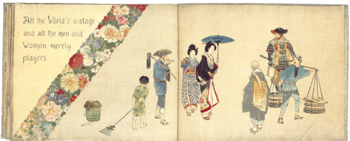
Pages 25-26 of The Smiling Book

right are a boy and a man smoking with a hoe on his shoulder. On page 26 are a priest, a samurai, a woman holding an umbrella accompanied by a maid, and a peddler carrying tubs of fish on a pole.