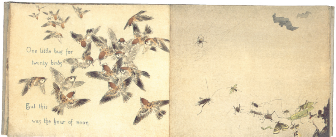
Pages 5-6 of The Smiling Book

However, the poem does not appear in the printed version owned by the NDL. The sources of these poems are unknown.