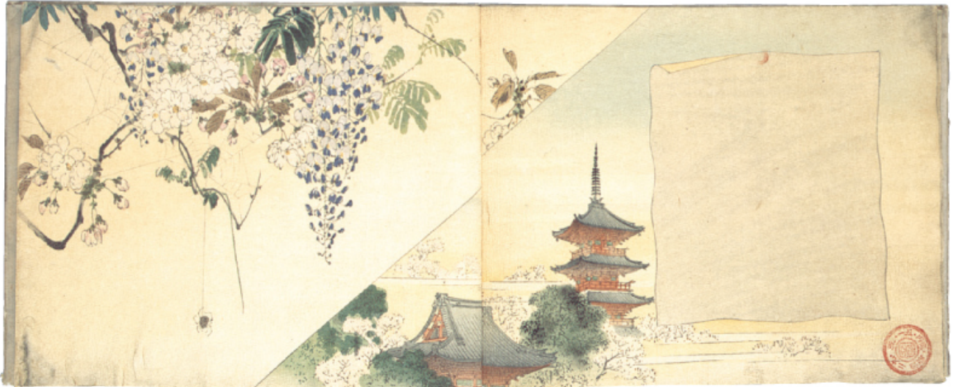
Pages 1-2 of The Smiling Book