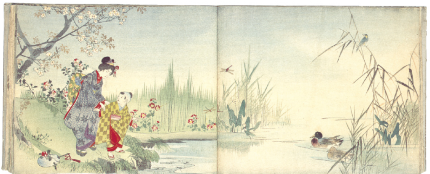
Pages 11-12 of The Smiling Book

The content of the poem and the word musmée suggest a novel of the French writer Pierre Loti, but it is actually a quotation from Helen Leavenworth Herrick's "CHERRY-BLOSSOM." 4 These words do not appear in the printed version owned by the NDL.