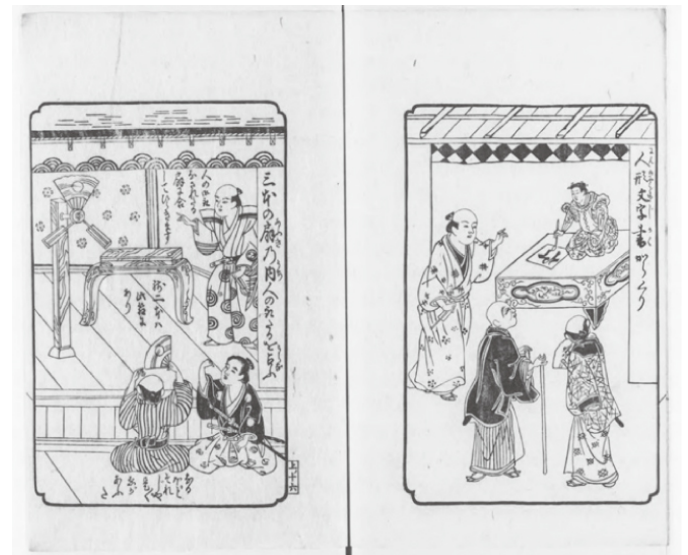
Illustration of Shuchin otogi karakuri kinmo kagamigusa

This pictorial reference book shows 28 kinds of "karakuri" (mechanical dolls made in the Edo period) described in the style of ezoshi , a very popular kind of illustrated story book published in the Edo period. Each of the structures of "karakuri" and how they work is depicted in pictures. The first edition was published in 1730. The material exhibited is the reprint published in 1929.