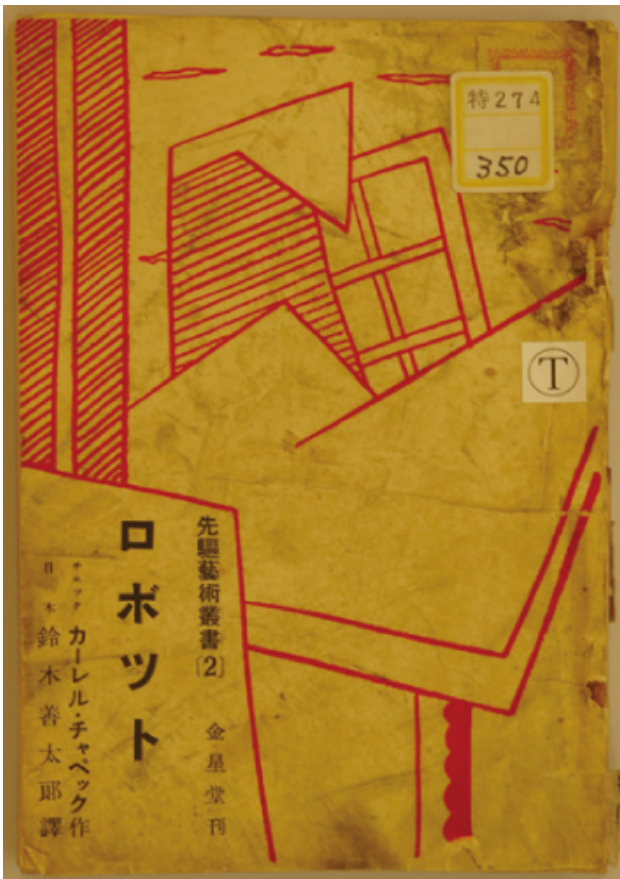
Cover of Robotsuto