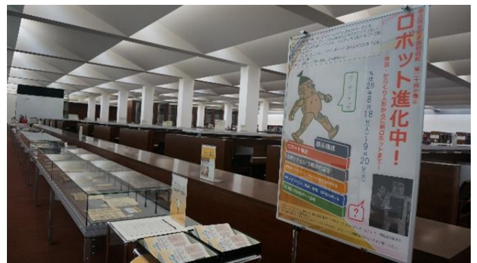
Display of the exhibition