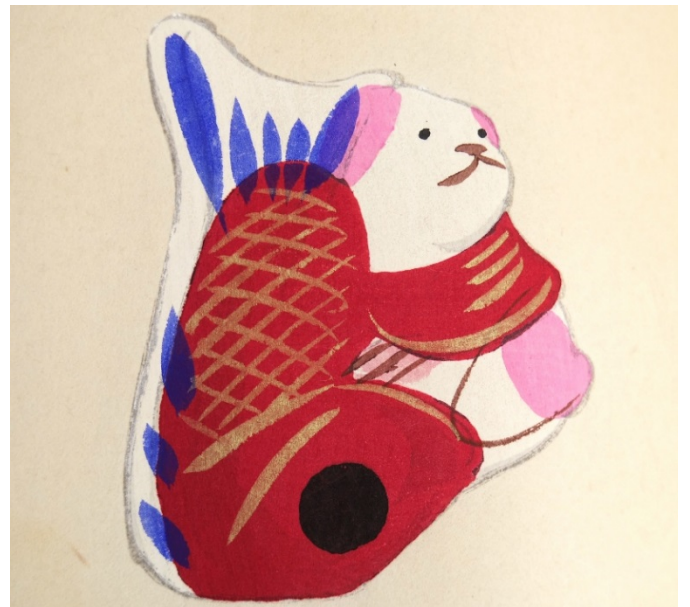
Kawasaki, Kyosen. Kyosen omochaeshu (Collected Illustrations of Toys by Kyosen). Omochaeshu Hangakai, 1918-19, 17 vols., NDL Call No. 422-29. * Available in the NDL Digital Collections

This woodblock print is included in Omocha junishi , a book made of washi and bound Japanese-style, comprising twelve woodblock prints of toy animals based on the twelve signs of the Chinese zodiac. The author, Kawasaki Kyosen, was born in Sakai, near Osaka, and was an apprentice of the ukiyo -artist Nakai Yoshitaki. Kawasaki's pictures of toys were quite popular throughout the Meiji, Taisho, and Showa periods. The exhibit includes 15 different toys illustrated in vivid color. The picture above depicts bobble-head dolls, clay dolls made in Fushimi, Kyoto, amulets from Hokkeji Temple in Nara, and so on.