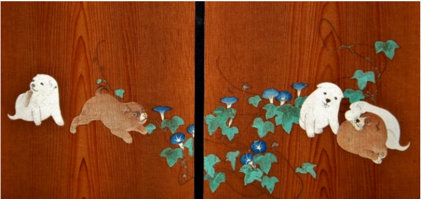
Wakan meiga sen (Selected Works of Art from Japan and China). Edited by Murayama Jungo, 2nd ed., Kokkasha, 1917, NDL Call No. 404-58 ｲ * Available in the NDL Digital Collections

(5) Kamisaka, Sekka. Momoyogusa (Chrysanthemums). vol. 2, Yamada Unsodo, 1909, NDL Call No. 406-32. * Available in the NDL Digital Collections