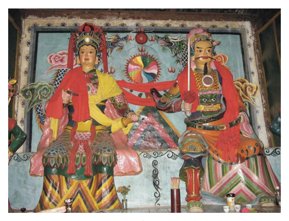
FIGURE I. Previous statues of Baijie and her husband at the "City of Virtue's Source," 2006.

Representations of Baijie in the writings of Bai scholars and public projects emphasize Baijie's ethnic identity, but they also present Baijie in highly gendered terms. Li Li (2006) and the online source referred to in note II describe Baijie as embodying feminine virtues, and the characters used for her name denote the virtue of sexual purity. In some ways, this echoes the local elite's adulation of her in the Ming and Qing. Baijie could serve as a counterweight to the image of unrestricted minority female sexuality, proof that Bai ideals for women's behavior are in line with those of the Han, and that the Bai are therefore an advanced nationality. While Dali intellectuals in the Ming and Qing increasingly minimized their cultural differences from the Han, in contemporary Dali both Bai scholars and tourism officials must confront the perception that the Bai are too Sinicized to