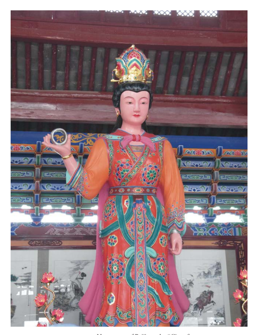
FIGURE 2. New statue of Baijie at the "City of Virtue's Source," 2009.

attract government funding for research projects or tourists interested in exotica. They can use Baijie to emphasize the differences between Bai and Han.