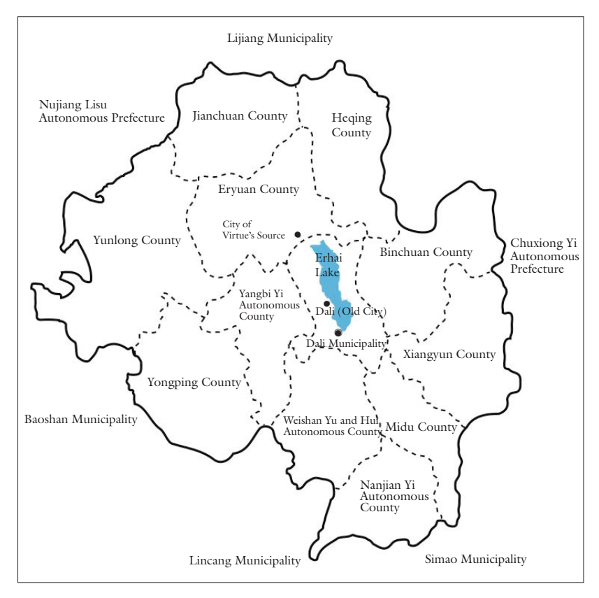
MAP 2. Dali Bai Autonomous Province. Shaded area indicates Erhai Lake.

Laos, and Burma. The Mongol conquest incorporated Dali into the territory of the Yuan dynasty, and Dali remained part of Ming and Manchu territory before becoming part of the Republic of China and finally the People's Republic of China.