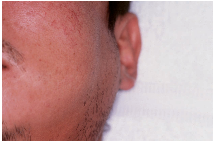
Fig. 1. A painful enlargement of the parotid gland developed in a patient.

that its levels had increased in a time-dependent manner (Table 2). Worker A had a level of about 3-times more than the upper limit of the normal range in our hospital 9 hours after the exposure, and the level reached 9-times more the next day. Worker B had a higher level of amylase compared to the normal value when he came to NIRS; the level was approximately 10-times the upper limit of the normal range on Day 1. The amylase level of Worker C was within the normal range, whereas it started to increase gradually during the day of the accident, and was almost 5-times over the normal limit on Day 1.