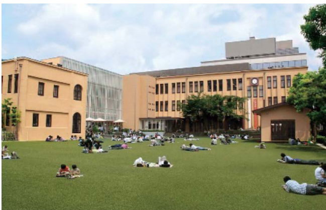
Kyoto International Manga Museum