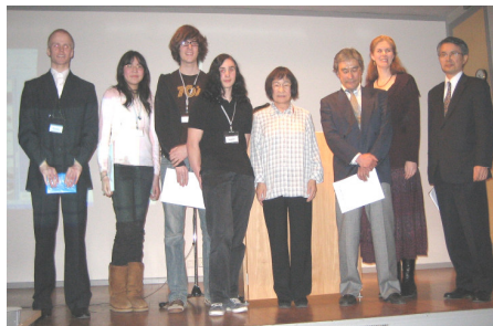
(↓) Winners and