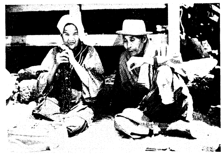
"Bring up for me whomever I shall name to you."