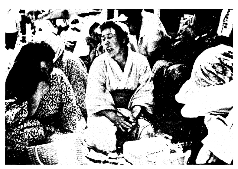
"I see a god coming up out of the earth."