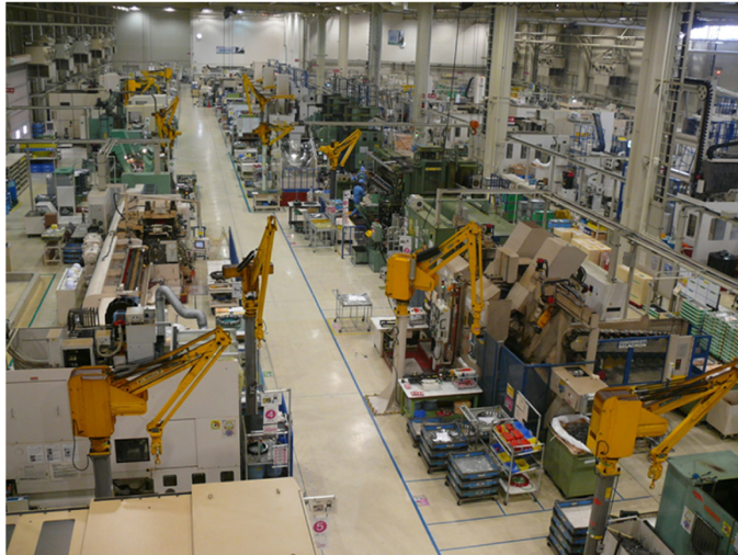
Figure 3 Main factory for civil aircraft engines (Factory 5 of MHI Nagoya Guidance & Propulsion Systems)

For these production hardware as well as development hardware are mainly manufactured in Factory 5 ( Figure 3 ) and assembly and repair is mainly performed in Factory 6. MHIAEL eagerly promotes the enhancement of cost competitiveness by proceeding with the introduction of line production and the improvement of process control for parts manufacturing, and through the establishment of the optimum combination of dock and flow line for assembly and repair.