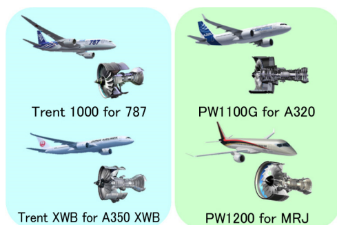
Mitsubishi Heavy Industries Aero Engines, Ltd.

The market for civil aircraft, being boosted by increasing air transport demand in recent years, is expected to more than double in the next twenty years. In such a market environment, Mitsubishi Heavy Industries, Ltd. (MHI) considers civil aircraft engines to be a future high-growth sector, and has been working on the engine development, manufacture and repair business, taking advantage of its expertise in combustor modules, low-pressure turbine components and other parts.