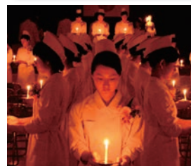
Capping ceremony of nurses