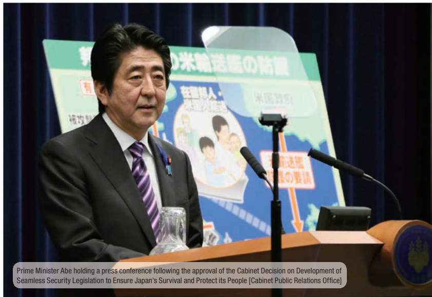
Prime Minister Abe holding a press conference following the approval of the Cabinet Decision on Development of Seamless Security Legislation to Ensure Japan's Survival and Protect its People