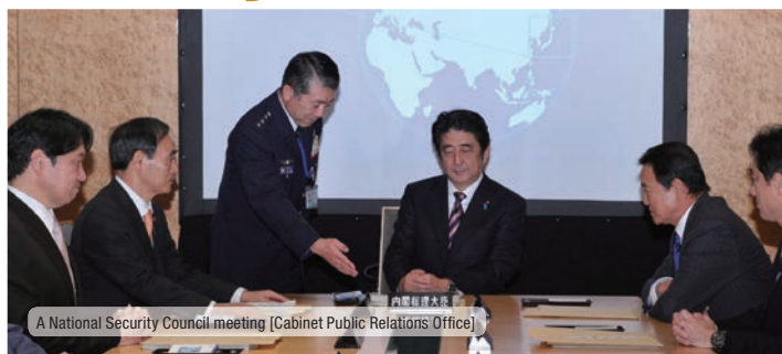
A National Security Council meeting