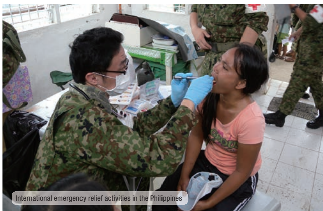
International emergency relief activities in the Philippines