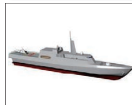
New destroyer (image)