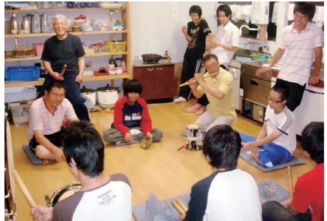
The parade of floats in Tanabu (Mutsu City, Aomori Pref.)

long use. This can thus motivate the inheritance groups in their activities.