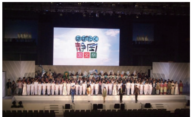
The 24 th National Cultural Festival, Shizuoka 2009 Opening Festival

Those that comply with the objectives of the National Cultural Festival and are hosted by local governments, culture-related groups, and corporations and other organizations nationwide. They consist of performances, contests, festivals, exhibitions, classes, and other events.