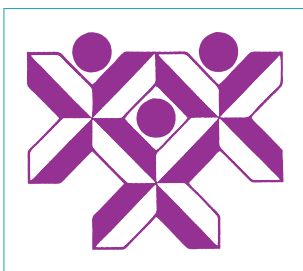
Logo of the National Festival (designed by FUKUDA Shigeo)

This year, the 25 th holding of the festival takes place in Okayama under the title of "Appare Okayama Kokubunsai."