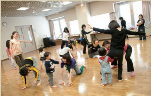
〈Setagaya Public Theater〉 [Body workshop with contemporary dance]

The project supports theatrical performance shows independently planned, produced and held by local theaters and music halls as well as workshops, lectures and other educational activities designed for local pupils, students and adults.