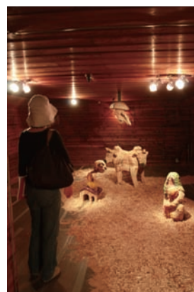
Activities in Nakanoyo Town: A space in a traditional building of the former Hirozakari Shuzo is utilized in Nakanoyo Biennale

in a cross-disciplinary manner in industrial promotion and the revitalization of local communities, etc.