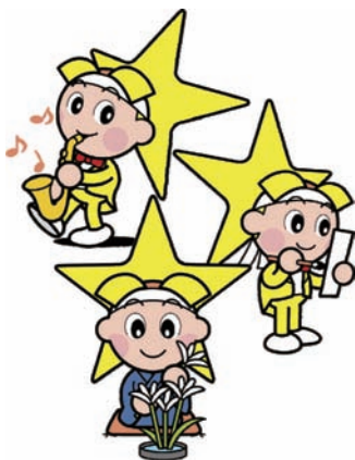
Mascot for Okayama Pref.: Momocchi