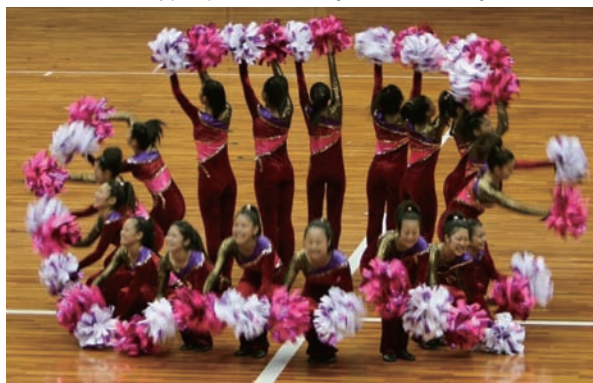
Performance by participants in the Marching Band & Baton Twirling division