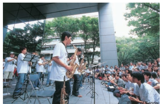
Activities in Sendai City: Jozenji Street Jazz Festival is held on the streets and is organized by citizens' cooperation.