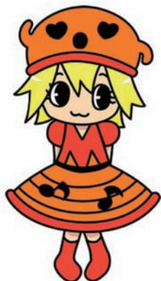
Mascot of the Miyazaki meet: Hania