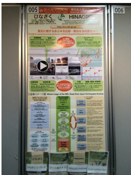
<<The NDL poster exhibition>>

In the poster exhibition, the NDL exhibited a poster which introduced the NDL earthquake records acquisition and preservation project and showed the function and usage of HINAGIKU.