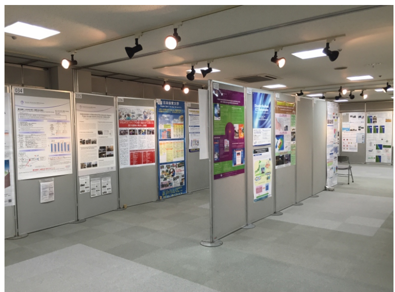
<<The poster exhibition hall>>