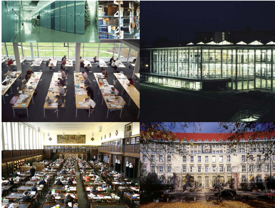
<<Two buildings of the DNB in Leipzig and Frankfurt, in pictures>>

"Deutsche Bücherei Leipzig" founded in 1912 and the "Deutsche Bibliothek Frankfurt am Main" founded in 1946. The DNB has holdings of 27 million items (on the basis of bibliographic records) and the number of employees is about 600.