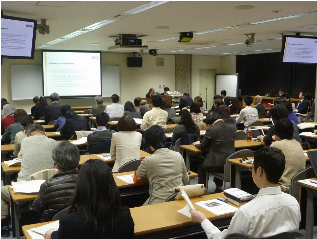
<<View from the audience>

The following Q&A session that lasted 60 minutes dealt with a wide range of questions from the floor.